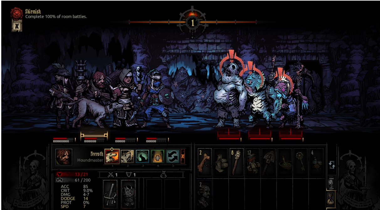
Slika 20 - Heroji nailaze na neprijatelje

Kretanjem kroz tamnice, heroji često nailaze na neprijatelje koje je potrebno poraziti kako bi se nastavilo sa istraživanjem. Neprijatelji također dolaze u grupama te svaki ima svoje napade. Neki neprijatelji, zbog potencijalne štete koje mogu nanijeti, su od većeg prioriteta za napasti od drugih.