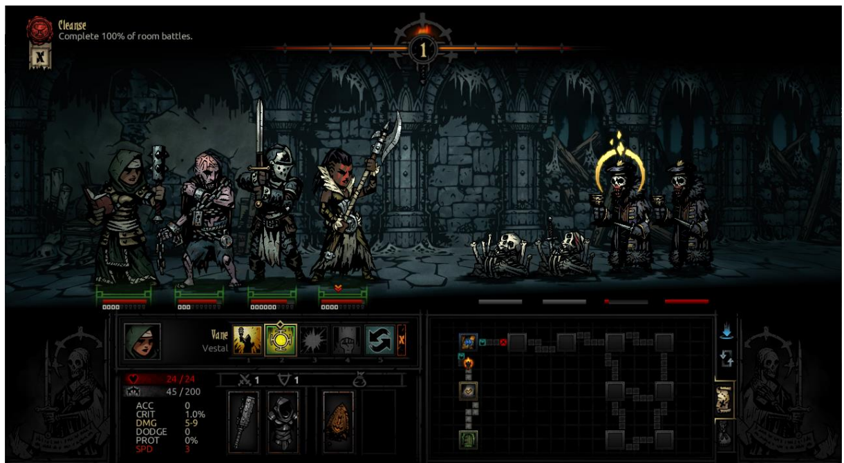
Slika 1 – Prikaz kruga borbe

Neke ciljeve moguće je jednostavno izvršiti u sklopu samog Pythona, ali za biranje neprijatelja i interakcije sa predmetima u okolini, lakše je koristiti SWI-Prologove baze znanja i procese zaključivanja.