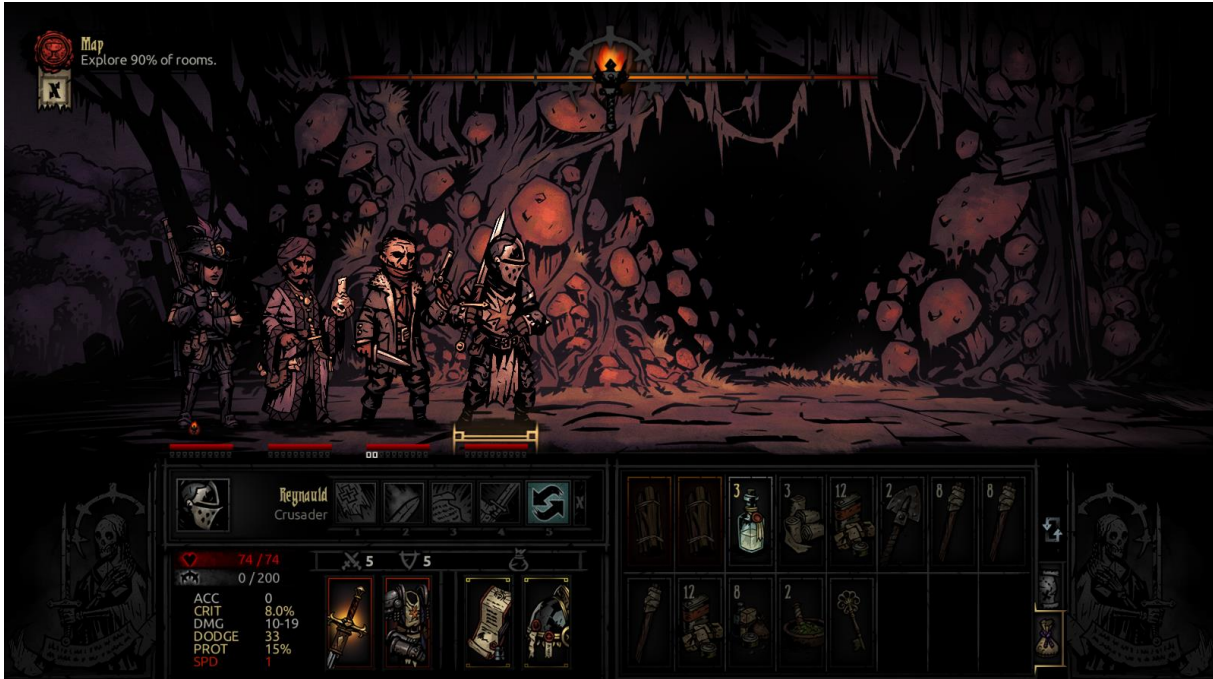
Slika 2 – Prikaz početne sobe misije

Prilikom početnog pokretanja, program pregledava sve pozicije heroja i zapisuje njihove značajke. Pomoću Pythonovih funkcija, program pozicionira pokazivač miša pomoću unaprijed definiranih vrijednosti na sve četiri pozicije heroja i sakuplja podatke o njima.