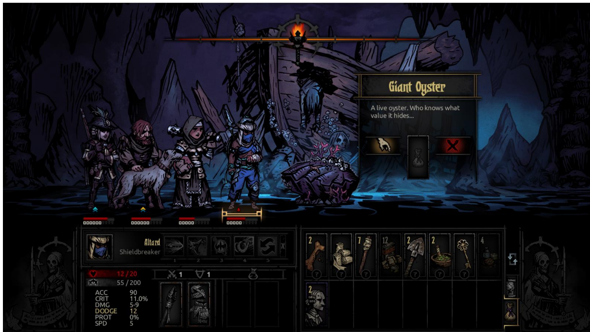
Slika 16 – Prikaz detektiranja predmeta u prostoru "curio"

Python pomoću imagesearch knjižice detektira da se na ekranu otvorio prozor sa ponuđenim opcijama. Imagesearch funkcija traga za sličicom ruke. Ako je ruka locirana, pokreće se "imagesearch_from_folder" funkcija koja uspoređuje sve slike iz zadane mape sa trenutnim ekranom (zbog fonta u igrici, knjižica za detektiranje teksta je često griješila prilikom pretvaranja slike u tekst). Funkcija prepoznaje uzorak "Giant Oyster"-a i vraća X i Y koordinate gornjeg lijevog kuta te slike. Slika u samoj mapi je nazvana po predmetu te će uz ime slike stajati pozitivne koordinate. Filtriranjem popisa moguće je izvući samo ime slike i tako saznati o kojem predmetu je riječ.