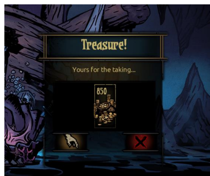
Slika 19 – Prikaz rezultata korištenja dobrog predmeta