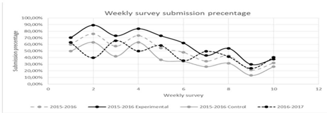
Figure 2. Percentage of weekly survey submission